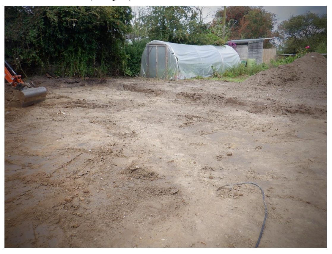
Plate 5. Ground reduction completed (looking North)