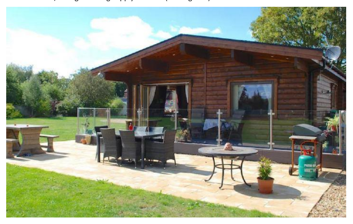
Plate 7. Proposed style of build