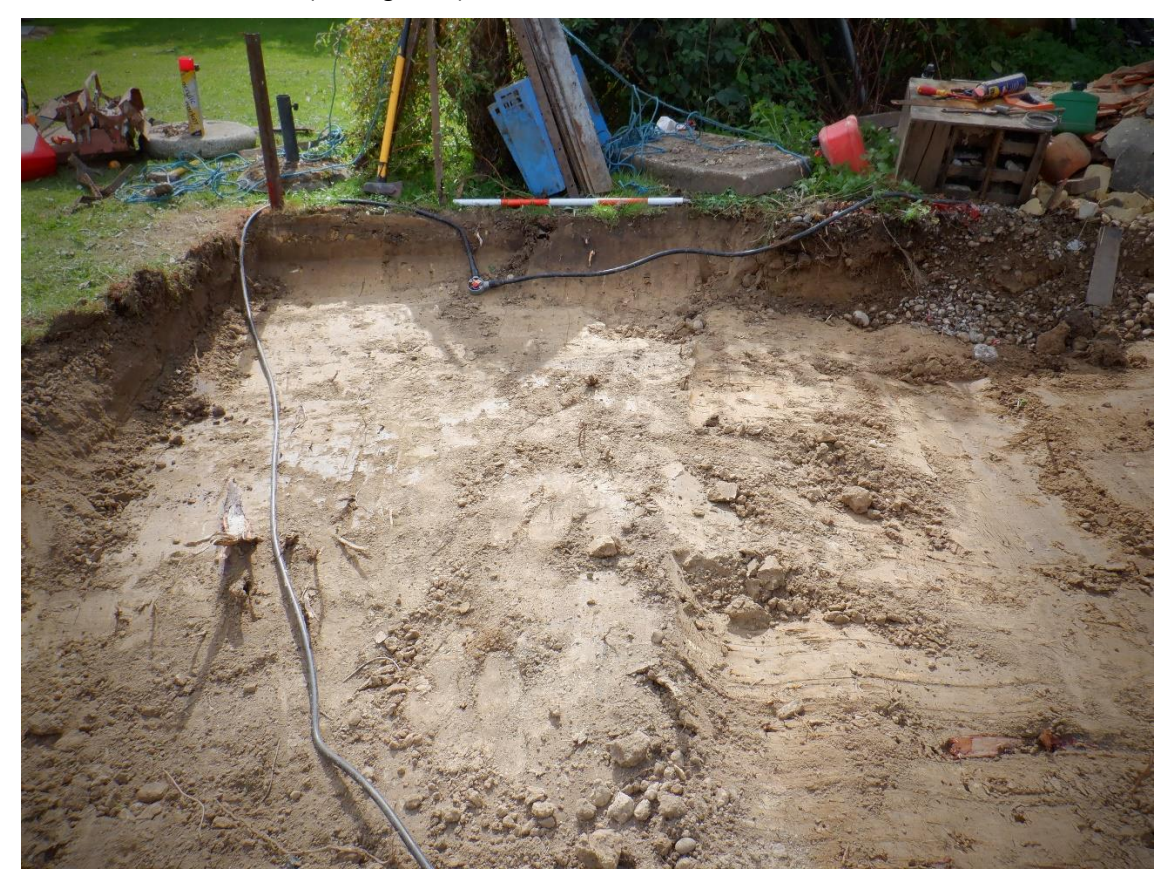
Plate 3. Ground reduction (looking West)