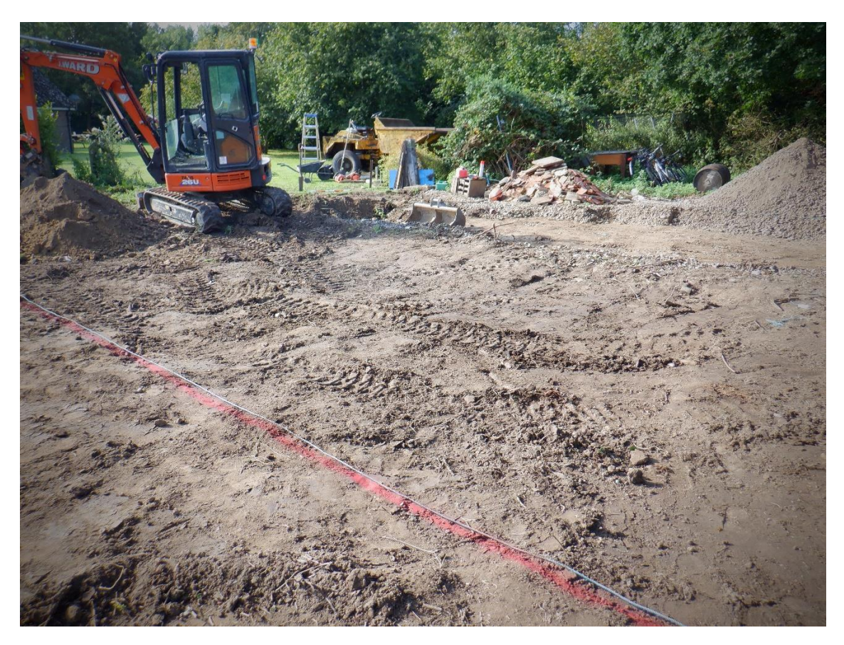
Plate 2. Ground reduction (looking West)