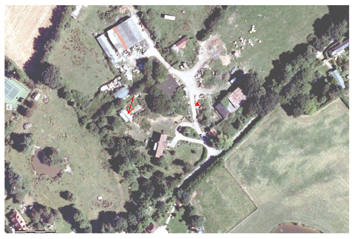
AP 1. Area prior to redevelopment- red arrow