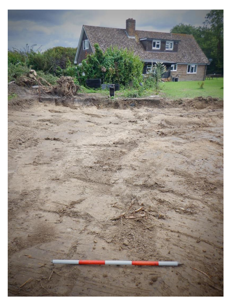
Plate 4. Ground reduction (looking SSE)