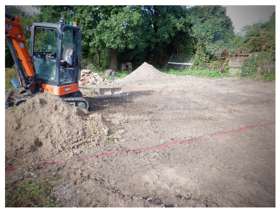
Plate 1. Setting out and starting ground reduction (looking SW)