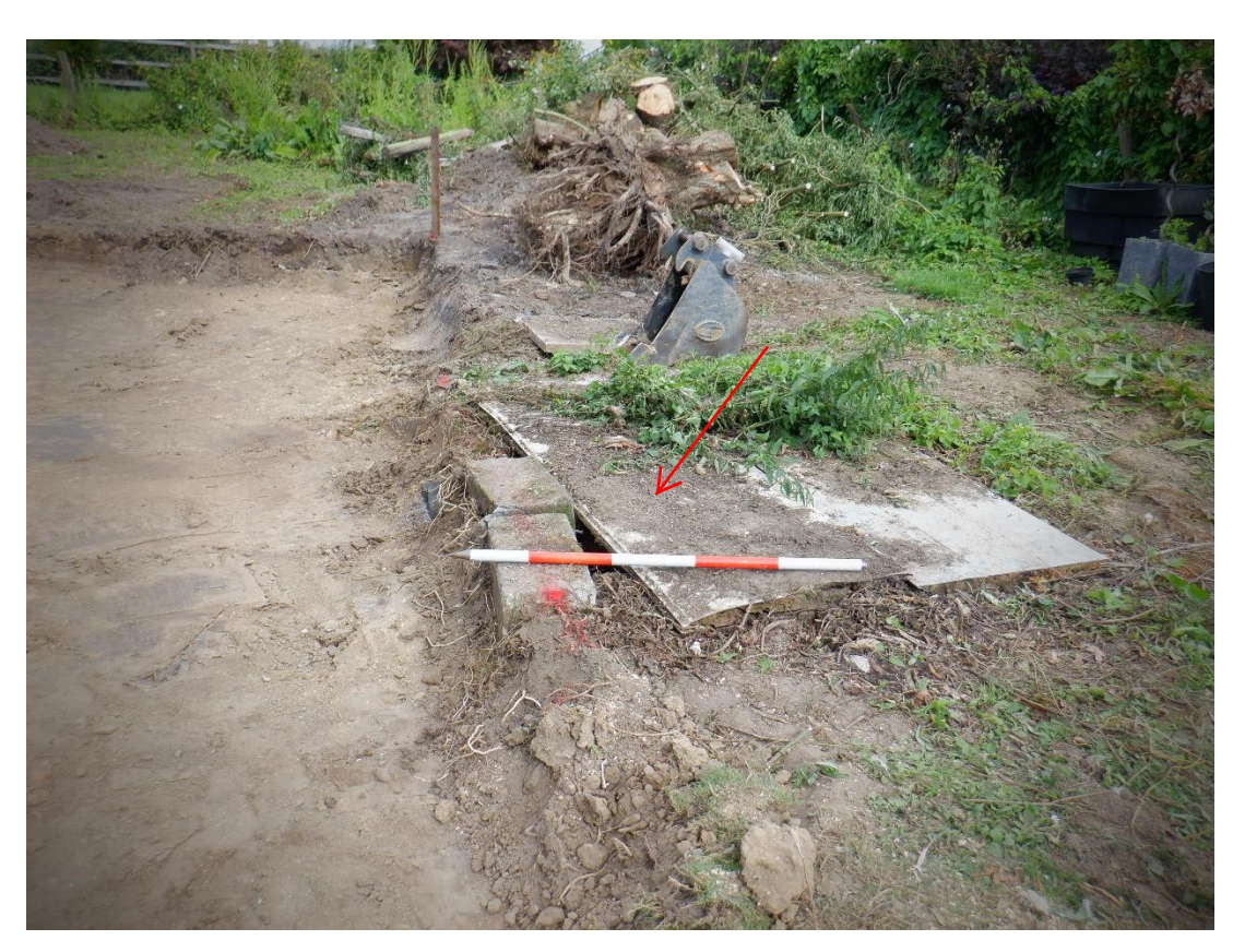
Plate 6. Water/sewage existing supply location (looking East)